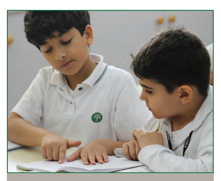
Peer tutoring in action in ISC-Shariah

On an academic level, ISC-Sharjah implements the SABIS® Educational System, a comprehensive and challenging academic program that uses cutting-edge software and a distinct approach to teaching and learning. Like all SABIS® Network schools around the world, ISC-Sharjah implements the SABIS Point System® at all grade levels. Through the SABIS Point System®, students learn through a systematic learning process that engages them in both individual and group work.