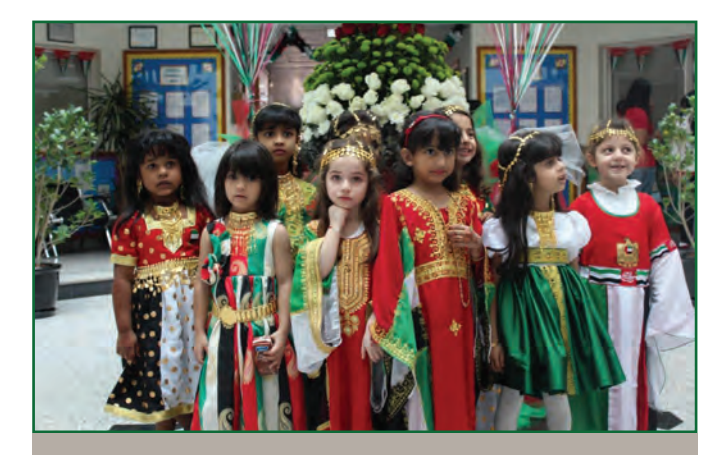
ISC-Sharjah students celebrating U.A.E. National Day

The school celebrates its cultural diversity in numerous ways. International Day, for example, is a bright and colorful celebration of the cultures that exist in harmony at ISC-Sharjah. The entire community – students, parents, and teachers alike – all come together to showcase dances, music, and food from the many cultures at the school. ISC-Sharjah also celebrates U.A.E. National Day in order to teach students about their local host country.